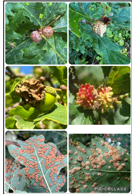
Galls on Oak Trees

flies. The variety of forms is amazing and fascinating. We finished the morning by exploring the brilliant Narnia trail in the woods.